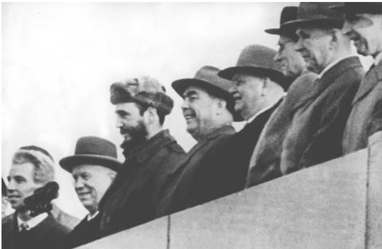
Nikita Khrushchev, Fidel Castro, Leonid Brezhnev and others

One of the darkest issues during this period was the role of the Cuban revisionists as mercenaries of Soviet social-imperialism in the countries that tried to fight for their independence, as well as in