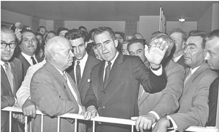
Nikita Khrushchev in his meeting with Richard Nixon, then Vice-President of the U.S. The revisionist bigwig Leonid Brezhnev is also there.

The World Federation of Trade Unions, once the powerful