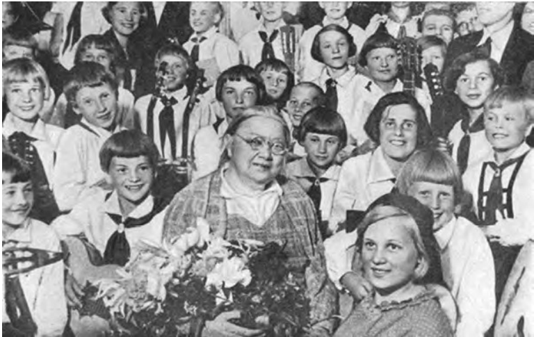
Nadezhda Krupskaya, Great Bolshevik personality and Soviet educator

As the Civil War drew to a close and the Soviet power launched the New Economic Policy, the economy gradually began to revive and the Commissariat had the peace to carry forward its programmes. Funds were still a problem as the Central Commissariat and the local Soviets were on strappy budgets. Hence the schools had to charge a fee on students from primary to higher level between 1922 and 1927. Even though the fee in primary schools was abolished in 1927, it was retained in secondary and higher educa-