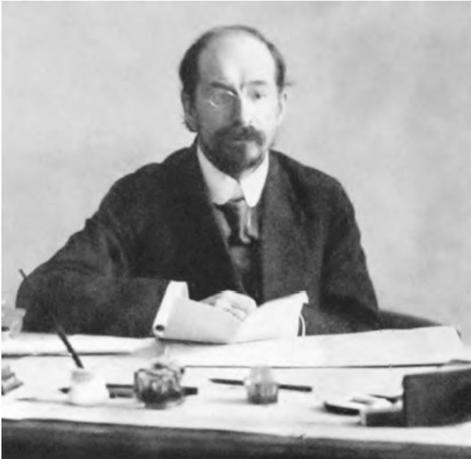
Anatoly Lunacharsky, First Commissar of Education of the USSR, after the victory of the October Revolution.

When the new Soviet Government was named on the day following the revolution, Lunacharsky was to head the newly established Commissariat of Enlightenment. The incipient Soviet Education Commissariat faced resistance from the old bureaucrats and teachers and had to restore the rudiments of school system. However this would not be a return to the old system, but the setting up of a democratic system. In fact, democratisation of school education was foremost on the agenda. Lunacharsky declared, “ The State Education Commission is certainly not a central power directing educational institutions. On the contrary, all school affairs must be handed over to the organs of local self government. The independent action of... workers, soldiers and peasants’ cultural educational organisations must achieve full autonomy ” (cited in S Fitzpatrick, Commissariat of Enlightenment, p. 26).