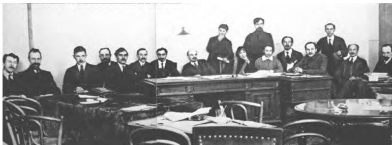
First Council of the People’s Commissariats (Ministers) of the Revolutionary Government, formed after the victory of the October Revolution. Alexandra Kollontai was part of this Council as Commissar of Public Welfare