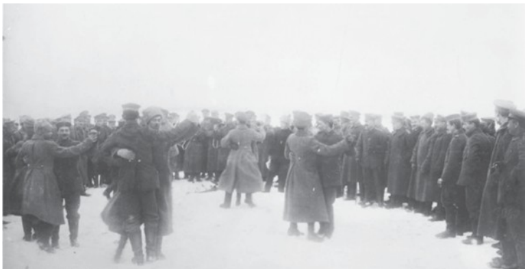
German and Russian soldiers celebrate the truce on the German-Russian front in January 1918.

The Great October Socialist Revolution and the preceding February 1917 Revolution developed directly out of the first