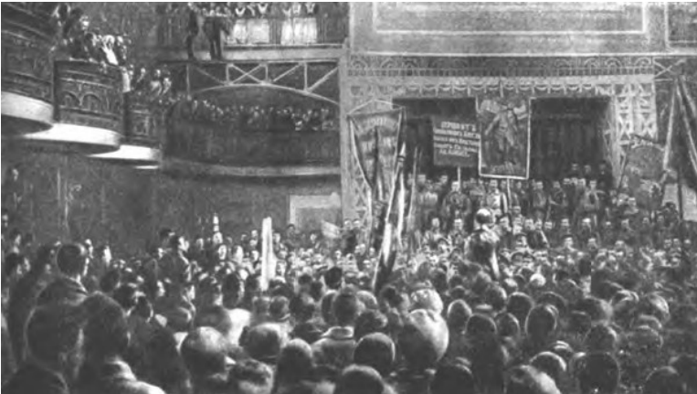
Congress of Peasant Soviets, May 1917

From the characterization of each stratum one can understand the behavior of the peasantry; the tactics of the Bolsheviks consisted in attracting the poor and middle peasants to embrace the path of the Socialist Revolution and that of the collective farming.