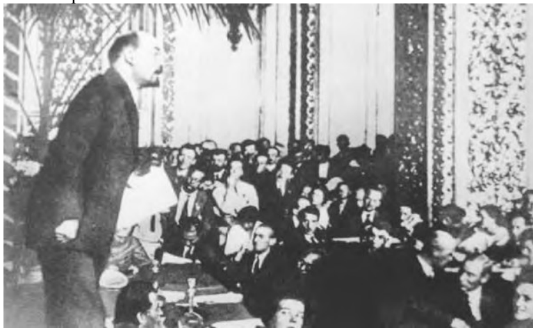
Lenin at the Zimmerwald Conference

In spite of the difficulties of the war and the spreading of chauvinism, Lenin was able, at the Conference of Zimmerwald (Switzerland, September 1915), to organize the internationalist revolutionary Marxists and to obtain the split from the social-chauvinists, thus laying the bases for international unity under the leadership of the “Zimmerwald Left”.