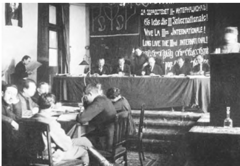
First Congress of the Communist International

The defence of the bourgeois democracy by the Social