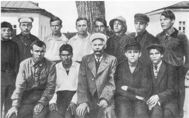
Anton Makarenko (back row, second from left), outstanding educator and Soviet pedagogue, with Maxim Gorky (front row, centre) and former members of the children’s commune

White-collar professions in industry and administration were much sought after, but most workers were content to make their children literate and skilled to earn more than what they themselves earned. The Soviet leadership too had its own requirements. It desperately needed a new generation of leadership in industry, economy, administration, intelligentsia, party and society which was proletarian in character and politically committed to socialism. Time and again, the unreliable nature of the old ‘bourgeois’ special-