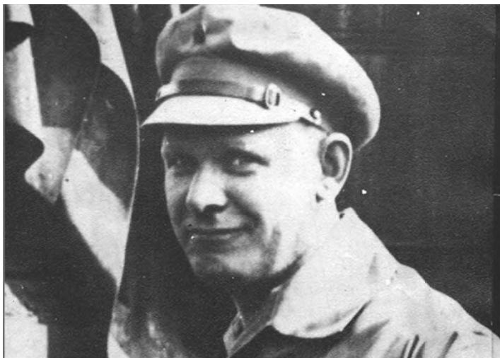
Ernst Thaelmann, chair of KPD from 1925

The KPD judged the situation described above as a revolutionary situation – with the unbearable war burdens, the shifting of