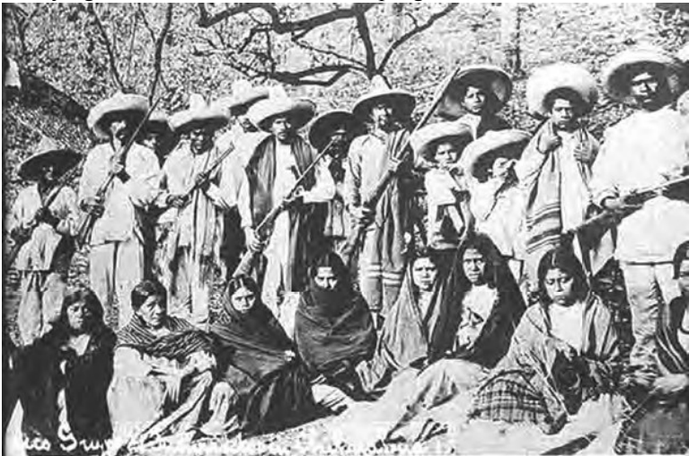
Insurgents and the Women

The great errors and limitations of the left of the Mexican Liberal Party, which marked its great difference with the successes of the October Socialist Revolution and its Bolshevik Party, were: that for the sake of unity, it maintained its bourgeois program of 1906, as the guideline of its structures (Liberal Clubs and circles), not clarifying to the masses that it was a program of a sector of the rul-