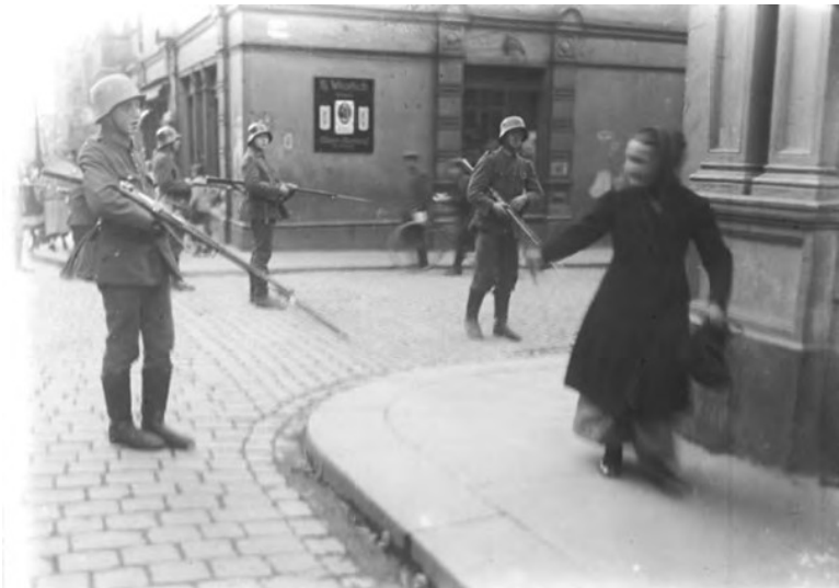
Hamburg: Heavily armed policeman searching for participants in the October struggles in 1923.