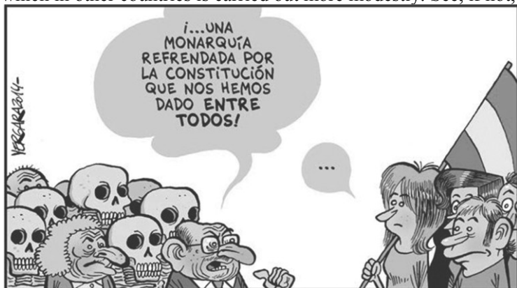
A monarchy voted for in the referendum on the Constitution that we have all provided ourselves!

It is easy to note, for any observer who is not too thick-headed, that in Spanish politics the fetishes of liberalism are particularly bare, in their falsity; such is the coarseness (or brutality) with which the Spanish right-wing manages its authoritarian nature in an “advanced democratic society.” 4 Obviously, neither is the vaunted division of powers safe from this systematic distortion of the theoretical principles espoused by liberalism, and which in other countries is carried out more modestly. See, if not,