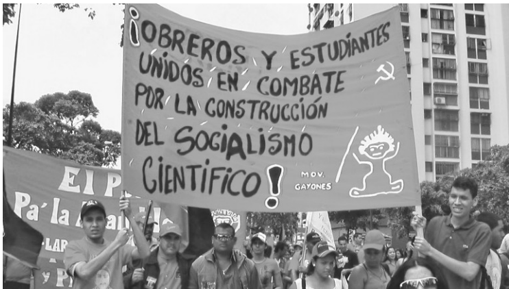
Banner reads: Workers and students united in combat for the building of scientific socialism!

In this scenario our task is to stimulate the class struggle and the people’s organization, to denounce the government’s weaknesses and negotiation with the capitalists who are striking at the living conditions of the people. In this way, we must take part in the leadership of the broad masses and moreover make use of the conditions of imperialist threats to fight to create the conditions for national liberation from the imperialist yoke in the only truly possible way: through scientific socialism. This means the suppression of the exploiters, a planned national economy, revolutionary workers control, promoting food sovereignty and economic sovereignty in general, developing heavy and medium-