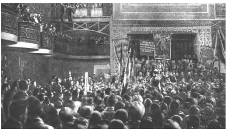
Congress of Peasant Soviets, May 1917

From the characterization of each stratum one can understand the behavior of the peasantry; the tactics of the Bolsheviks consisted in attracting the poor and middle peasants to embrace the path of the Socialist Revolution and that of the collective farming.