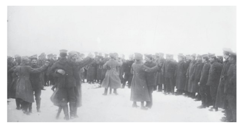
German and Russian soldiers celebrate the truce on the German-Russian front in January 1918.

The Great October Socialist Revolution and the preceding February 1917 Revolution developed directly out of the first