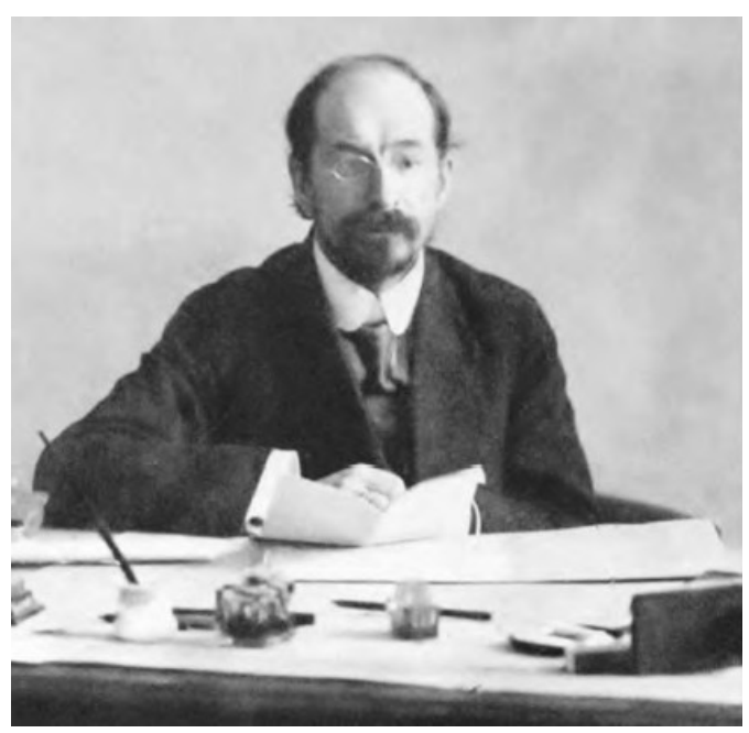
Anatoly Lunacharsky, First Commissar of Education of the USSR, after the victory of the October Revolution.

When the new Soviet Government was named on the day following the revolution, Lunacharsky was to head the newly established Commissariat of Enlightenment. The incipient Soviet Education Commissariat faced resistance from the old bureaucrats and teachers and had to restore the rudiments of school system. However this would not be a return to the old system, but the setting up of a democratic system. In fact, democratisation of school education was foremost on the agenda. Lunacharsky declared, "The State Education Commission is certainly not a central power directing educational institutions. On the contrary, all school affairs must be handed over to the organs of local self government. The independent action of... workers, soldiers and peasants' cultural educational organisations must achieve full autonomy" (cited in S Fitzpatrick, Commissariat of Enlightenment, p. 26).