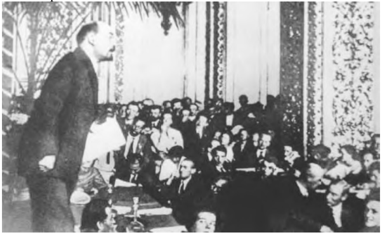
Lenin at the Zimmerwald Conference

In spite of the difficulties of the war and the spreading of chauvinism, Lenin was able, at the Conference of Zimmerwald (Switzerland, September 1915), to organize the internationalist revolutionary Marxists and to obtain the split from the social-chauvinists, thus laying the bases for international unity under the leadership of the "Zimmerwald Left".