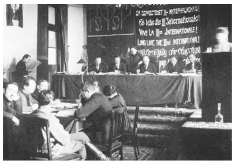
First Congress of the Communist International

The defence of the bourgeois democracy by the Social