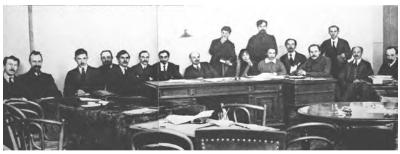
First Council of the People's Commissariats (Ministers) of the Revolutionary Government, formed after the victory of the October Revolution. Alexandra Kollontai was part of this Council as Commissar of Public Welfare