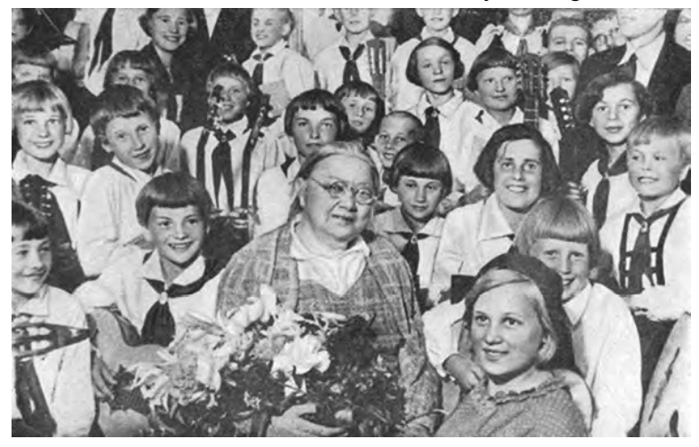
Nadezhda Krupskaya, Great Bolshevik personality and Soviet educator

As the Civil War drew to a close and the Soviet power launched the New Economic Policy, the economy gradually began to revive and the Commissariat had the peace to carry forward its programmes. Funds were still a problem as the Central Commissariat and the local Soviets were on strappy budgets. Hence the schools had to charge a fee on students from primary to higher level between 1922 and 1927. Even though the fee in primary schools was abolished in 1927, it was retained in secondary and higher educa-