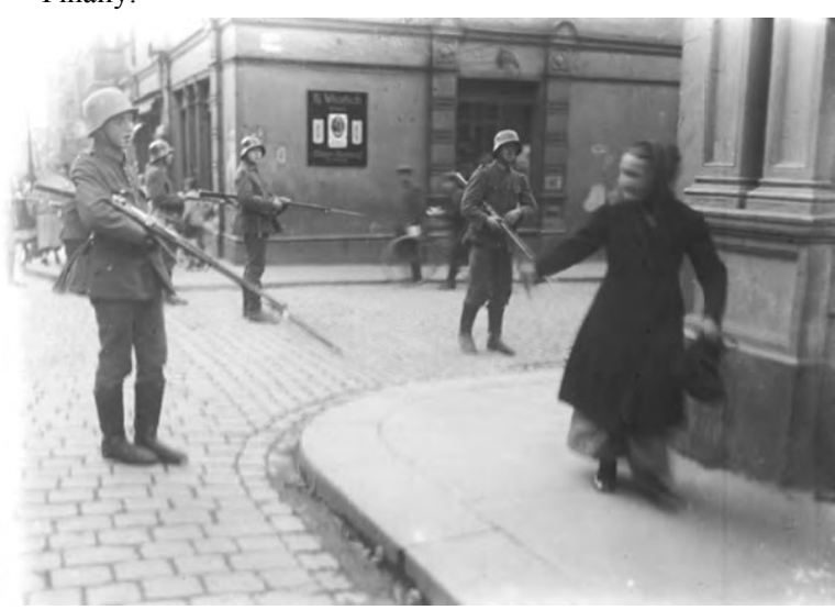
Hamburg: Heavily armed policeman searching for participants in the October struggles in 1923.